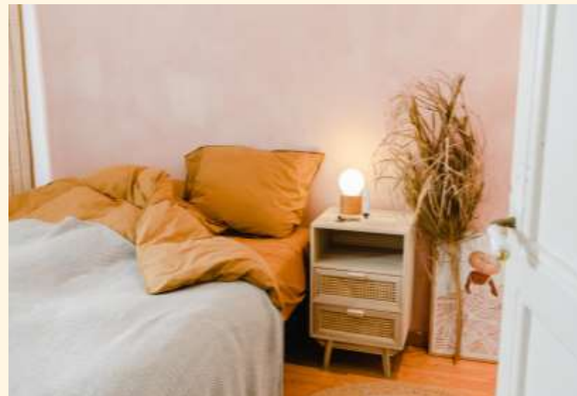
Learning @ IAEGlocal