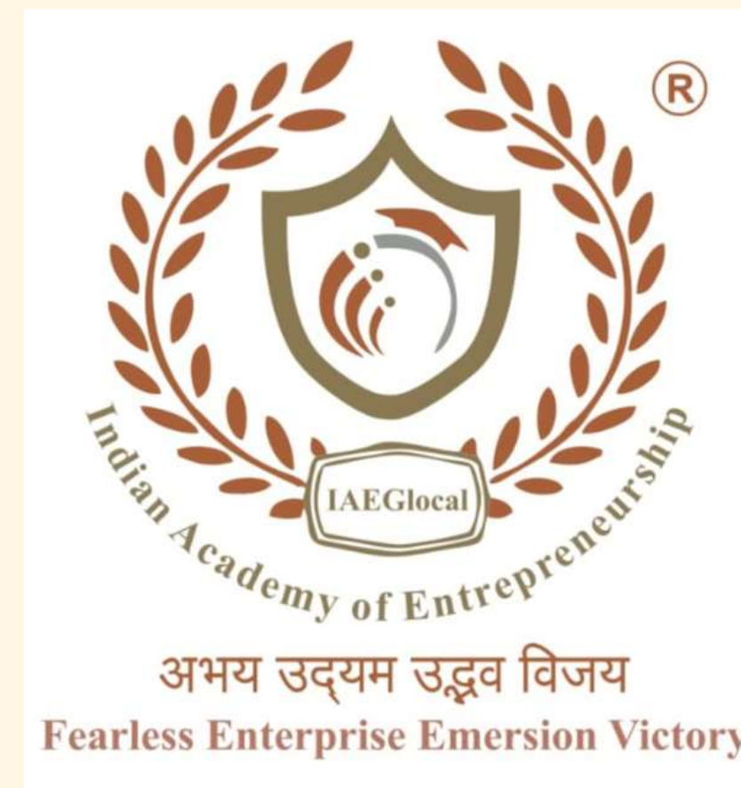
Global Head Quarter [GHQ] - India [Mumbai]