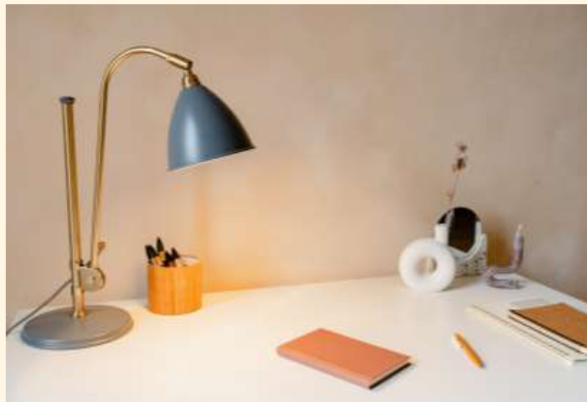
FSSUP @ IAEGlocal