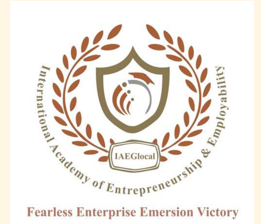
IAEGlocal Africa - Asia - Europe - Oceania - UK